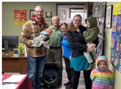
Enjoy photos from our recent Wayne Chapter Open House on April 5.

contact Tim Pruse at tpruse@milifespan.org or send a resume. The position is office-based, but does come with room for flexibility and creativity for a candidate motivated to build relationships with local school faculty, DREs, and youth ministers. It is an ideal position for a motivated local college student or part-time church staff member.