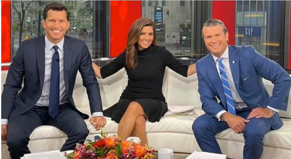
"Fox & Friends Weekend": Will Cane - Rachel Campos-Duffy - Pete Hegseth