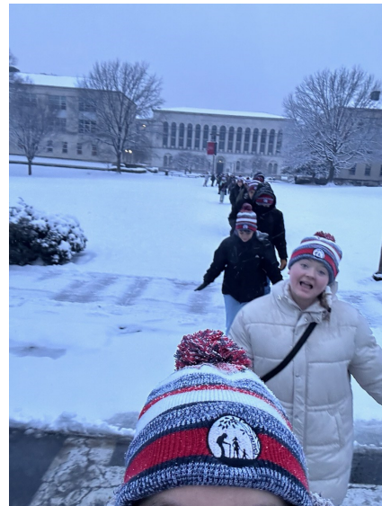
March for Life 2024 - Year 51!

Find us online at: miLIFESPAN.org & @miLIFESPAN