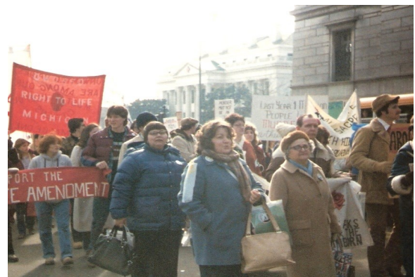
March for Life 1974 - Year 1!