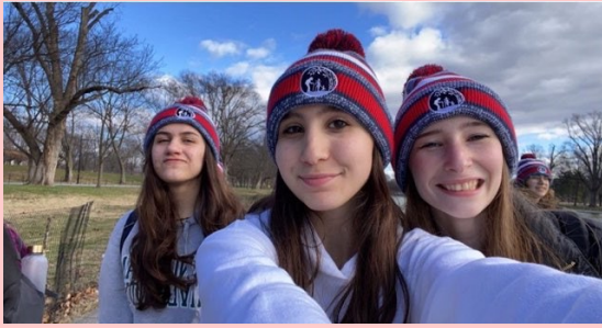
Lights for Life Campaign November - December, 2023