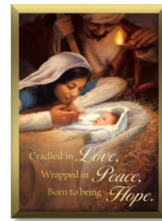
NEW for 2020! Cradled in Love