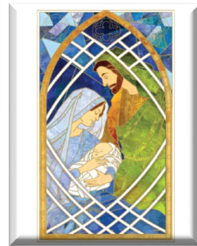
Stained Glass Holy Family