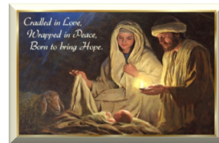
Born to Bring Hope