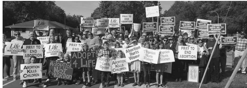
Livonia Life Chain