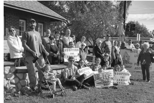
Belleville Life Chain