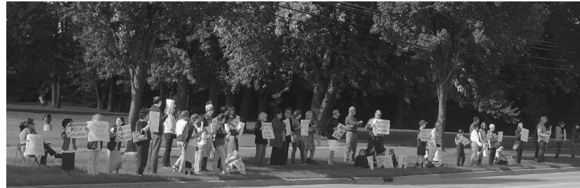
Ss. Cyril & Methodius Life Chain

Annual Dinner & $10K Raffle: Tuesday, May 5, 2020