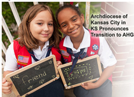
Archdiocese of Kansas City in KS Pronounces Transition to AHG